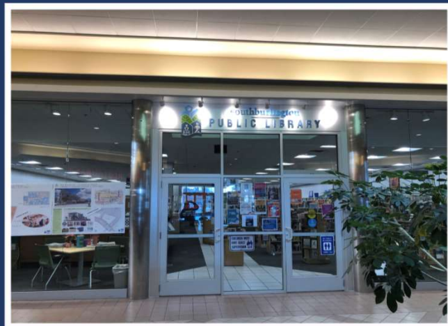
South Burlington Public Library

Libraries help your taxpayers connect with local government.