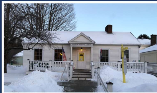
Varnum Memorial Library, Cambridge

Libraries are vital to a functioning democracy